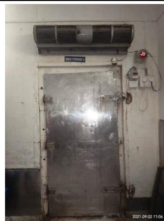
The temperature of the cold storage