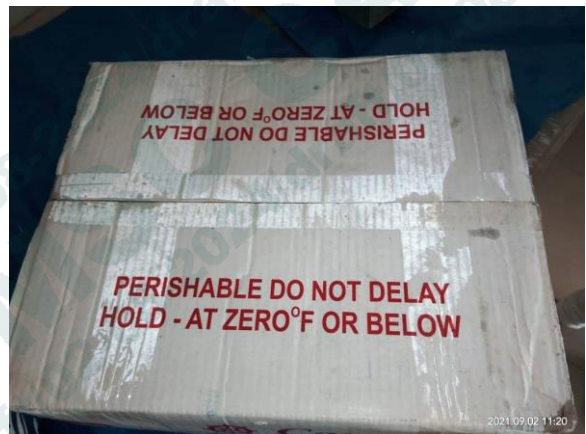
Marking on the boxes