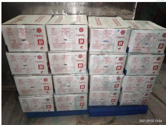
Cargo stacked in suppliers' cold storage