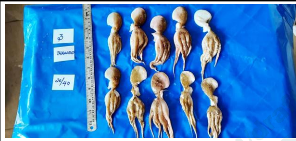
Inspection being performed