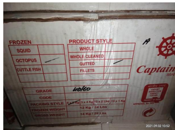
Marking on the boxes