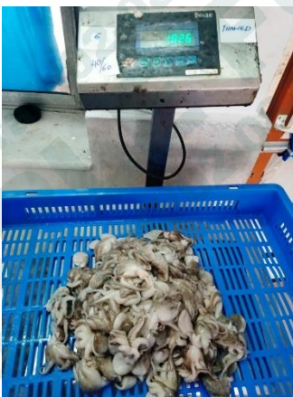
Inspection being performed