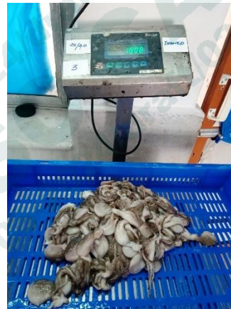
Inspection being performed