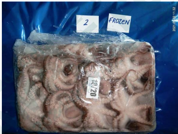
Grade-wise 1 block form each carton selected for inspection