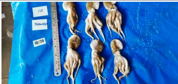
Inspection being performed