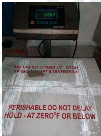
Gross weight checked of the boxes