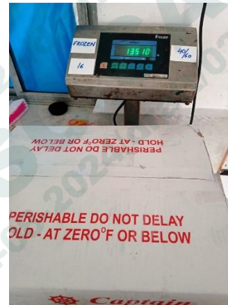
Gross weight checked of the boxes