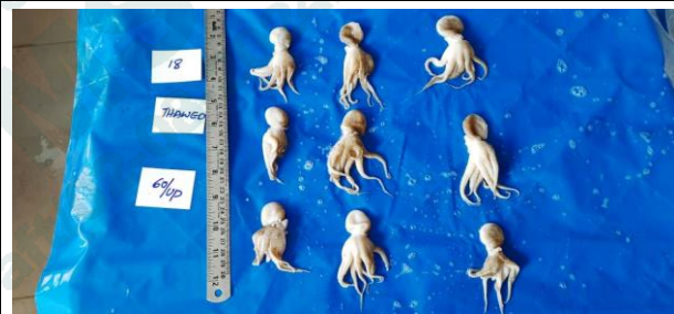
Inspection being performed