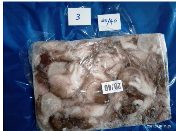
Grade-wise 1 block form each carton selected for inspection