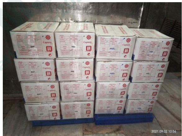
Cargo stacked in suppliers' cold storage