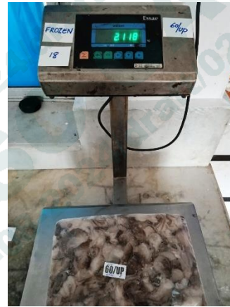
Weight checked of the selected block