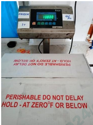
Weight checked of the selected block