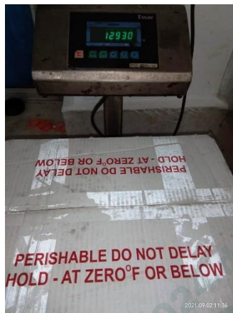
Gross weight checked of the boxes