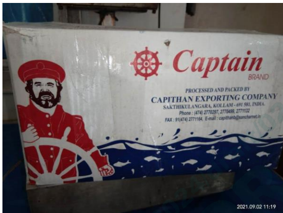
Marking on the boxes