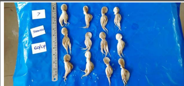
Inspection being performed