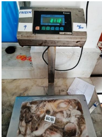
Weight checked of the selected block