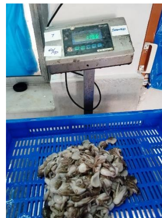
Inspection being performed