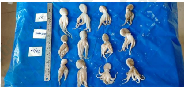
Inspection being performed