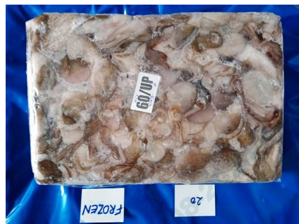
Grade-wise 1 block form each carton selected for inspection