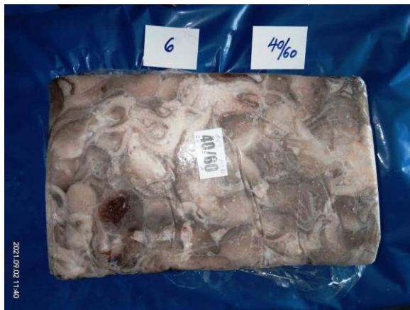
Grade-wise 1 block form each carton selected for inspection