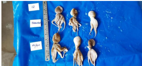
Inspection being performed