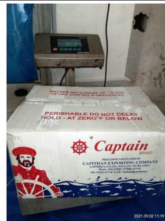
Gross weight checked of the boxes