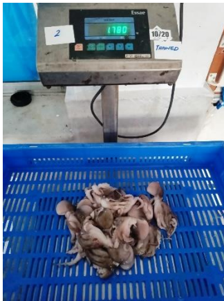
Inspection being performed