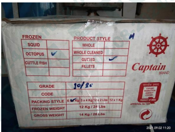
Marking on the boxes