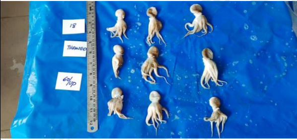
Inspection being performed