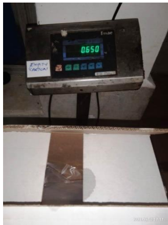
Weight checked of the empty box