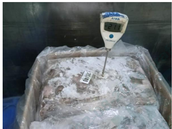
The temperature of the cargo