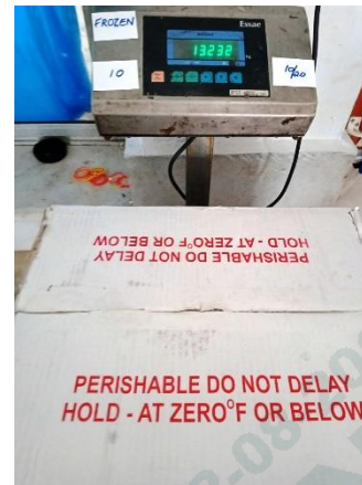
Gross weight checked of the boxes