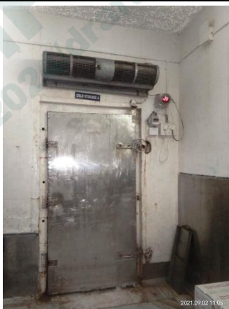
The temperature of the cold storage