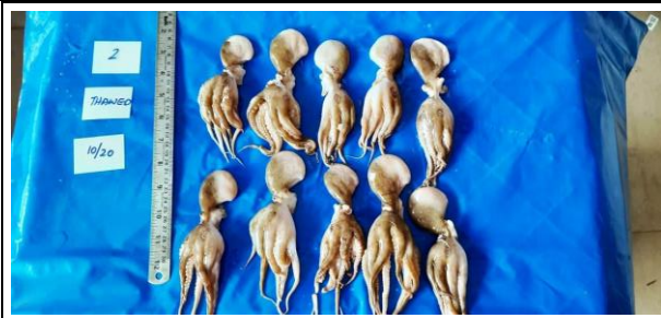
Inspection being performed